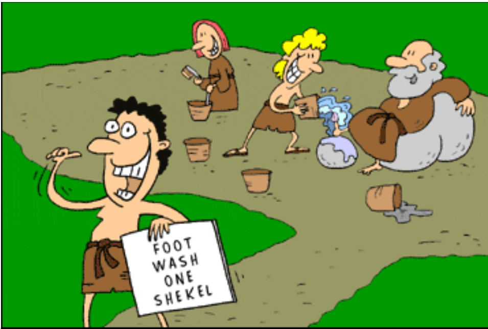
Youth group find-raiser in the early church